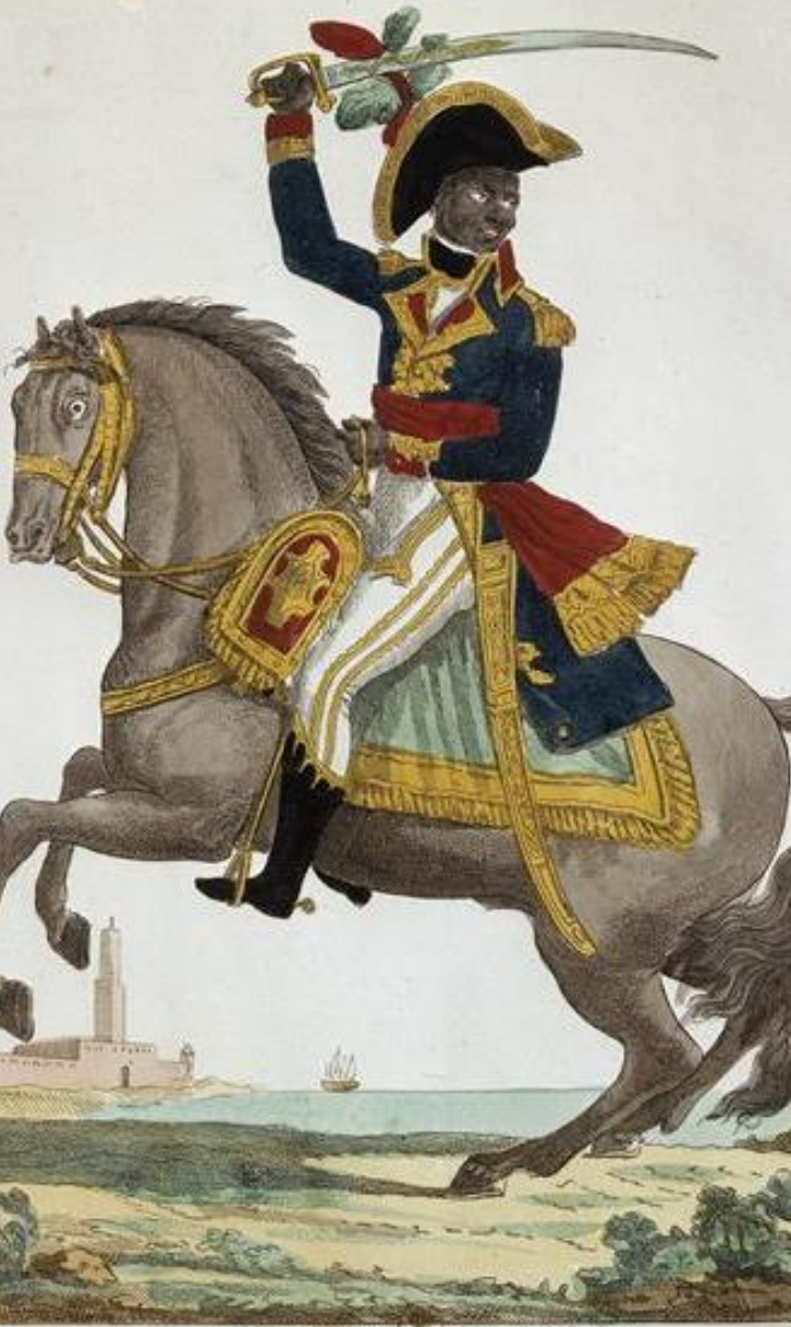
TOUSSAINT LOUVERTURE Chef des Noirs Insurgés de Saint Domingue A Paris chez Anquetin, Ann. de Bonaparte. N° 10.